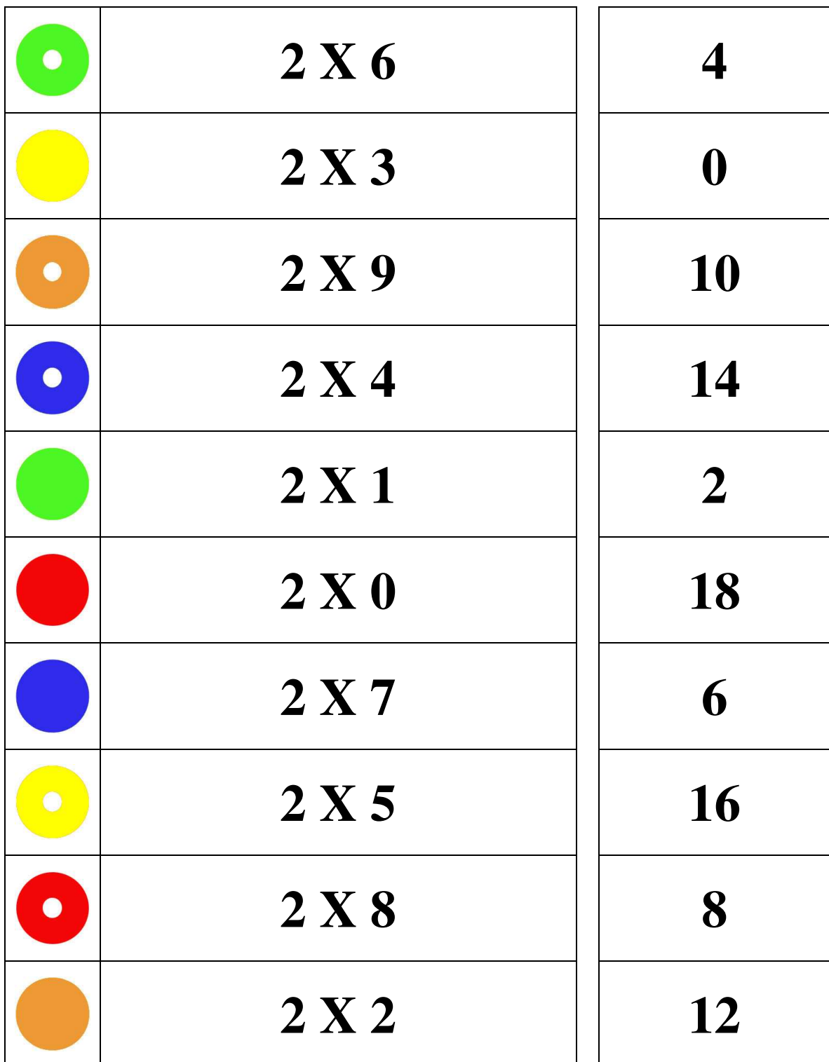
table de 2